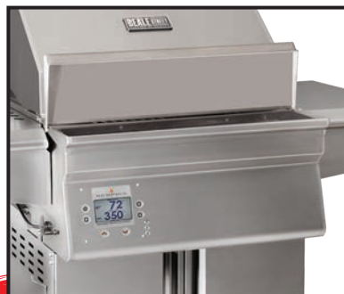
Front Loading Pellet Hopper

SEAR A STEAK? COOK A WOOD-FIRE PIZZA? SMOKE A BRISKET? ROAST A TURKEY? BAKE FRESH ARTISAN BREAD? IT'S ALL POSSIBLE ON A BEALE STREET GRILL, POWERED BY MEMPHIS